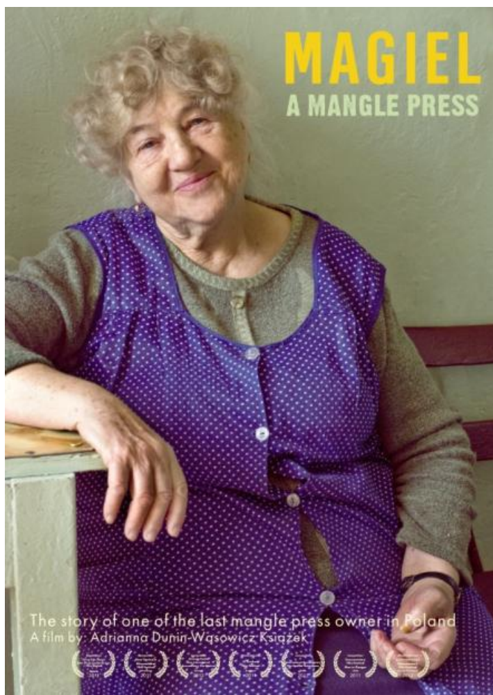
A Mangle Press ; 16', HD Pal, Poland, 2010

Piotr Zyla – sound mixing of Kantor’s Circle and recording of the music of A Mangle Press.